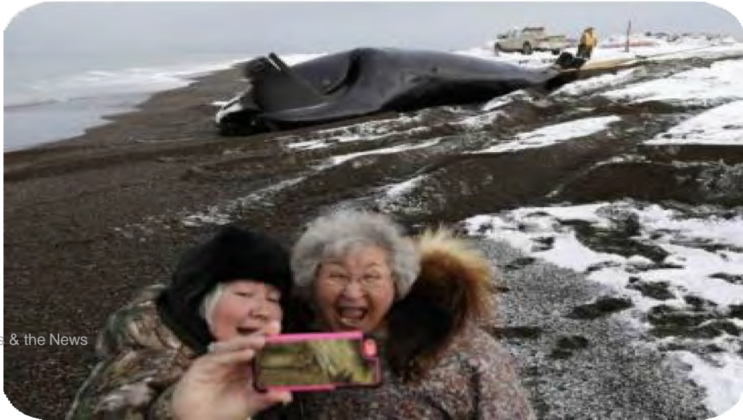
The Blues & the News